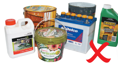
Hazardous waste or chemicals