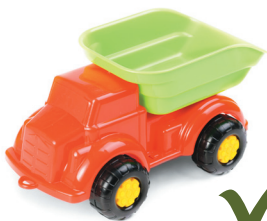
Hard plastic toys