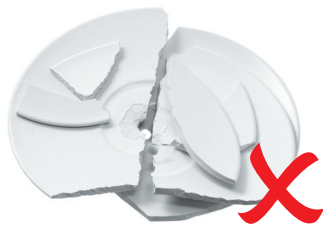
Pyrex, crockery or ceramics