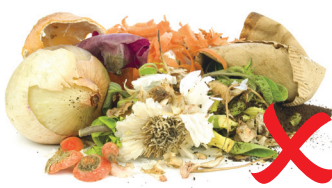
Food scraps or compost