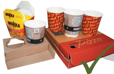
Cardboard boxes, cups and containers.