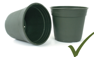
Plastic plant pots