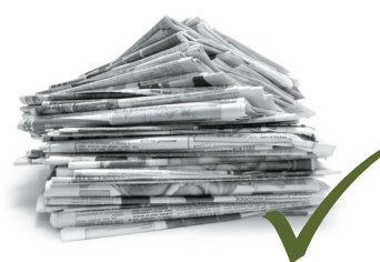
Papers, magazines, news papers, junk mail, envelopes