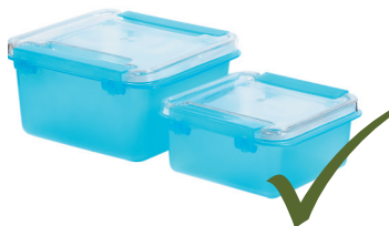
Hard plastic bottles and containers – including lids