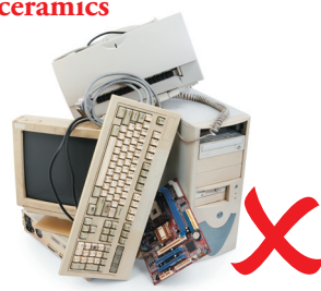
eWaste, computer parts or mobile phones