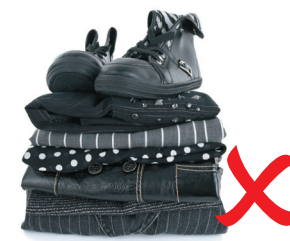
Clothing or shoes

For more information on how to dispose of items that don't go in the recycling or general waste bin, refer to Council's website www.cardinia.vic.gov.au