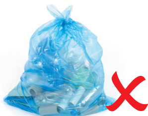
Recycling in plastic bags

Plastic easily torn or scrunched cannot be recycled, even if it has a recycling symbol.