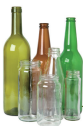
Glass bottles and jars – including lids

Items should be free from food and liquids.