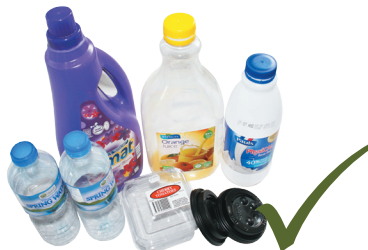
Plastic bottles and containers