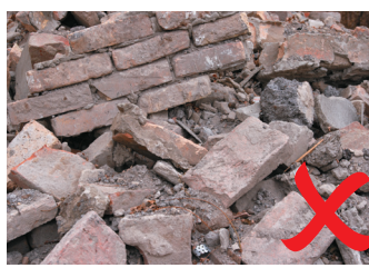
Building or renovation waste