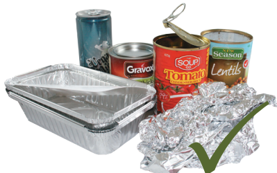
Aluminium and steel cans, foil and foil trays.