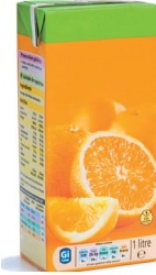
Milk and juice cartons